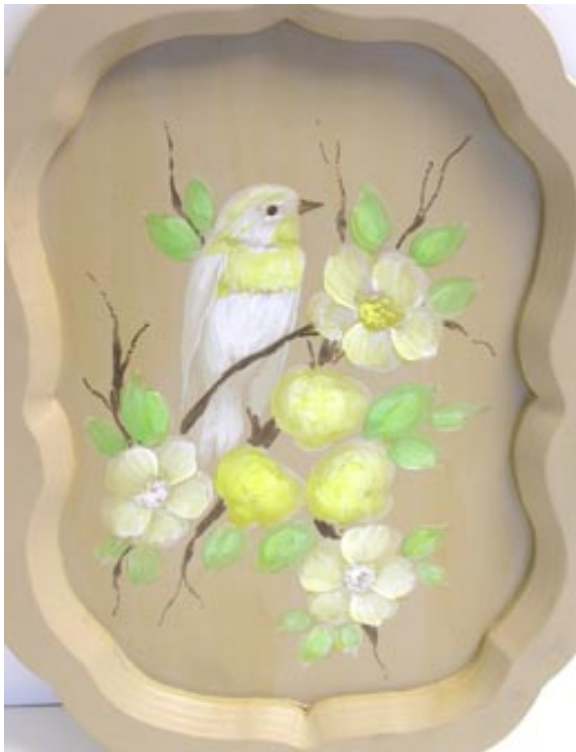
Photo of wash colors from Step 1 and 2

bright green from Phthalo Green + Raw Sienna and Hansa Yellow. Wash over the leaves with this color.