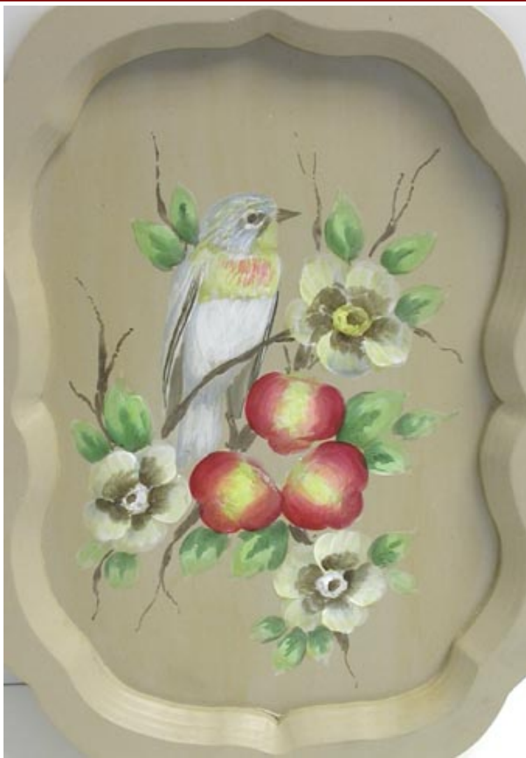
Overall Photo of Shadows